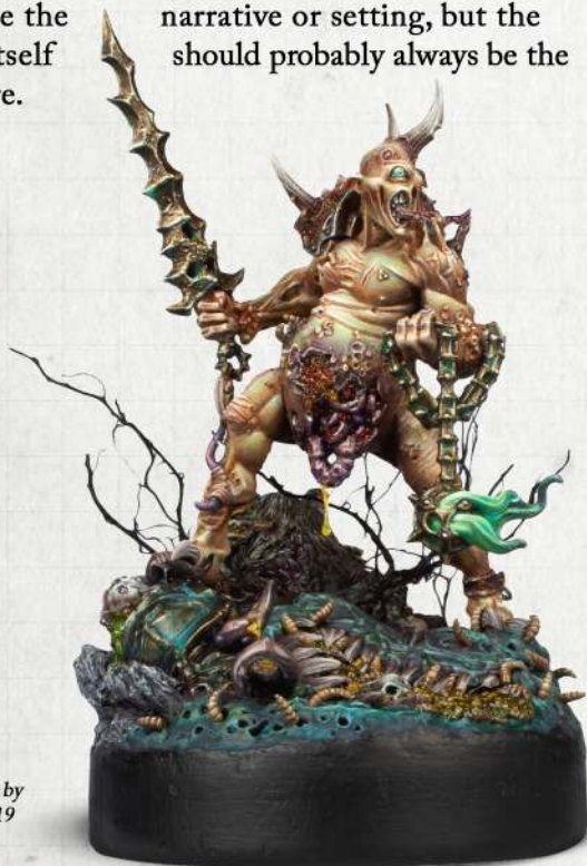
Herald of Nurgle by Yohan Leduc, 2019

A well-made base can be a great way to frame a model and describe the narrative or setting, but the miniature itself should probably always be the main feature.